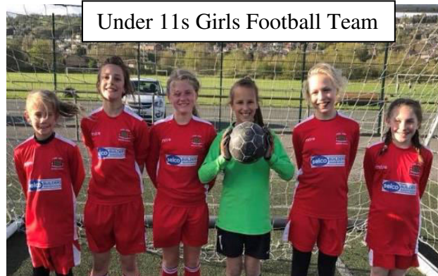
Under 11s Girls Football Team

Congratulations also to the Under 9s Boys Football Team who were runners up in their