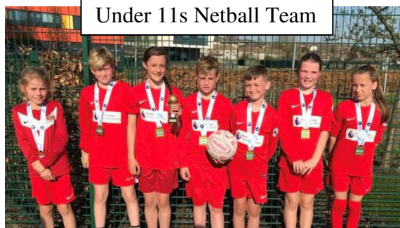
Under 11s Netball Team

The Under 11s Girls Football Team performed to a very high standard over several games. They didn't concede a single goal throughout, won every game and the competition!