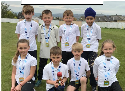
Under 9s Cricket Team

The Under 11s Netball Team won their netball league at Hanson in style by not losing a single game throughout the competition.